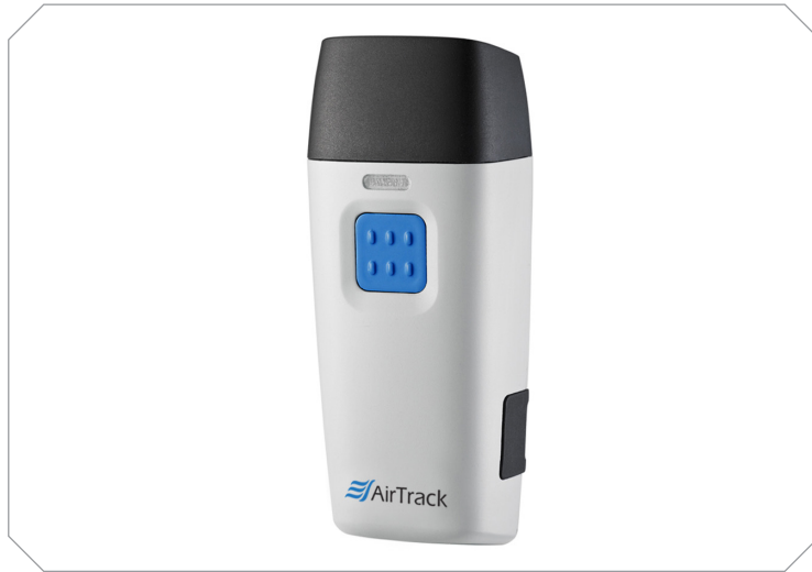
The SP1-C Pocket Scanner Installation Instructions & Popular Configuration Settings