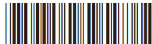
Clear all data

Scan here if you wish to erase the data stored on your SP1-C. Please keep in mind that this process is irreversible.